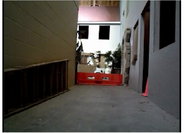
Figure 3: Visual frame from Experiment 1 aligned with the Commander-issued instruction.

rect” GPT-4 predictions may actually have been more contextually appropriate or safer, reflecting fuller environmental awareness (see Fig. 3).