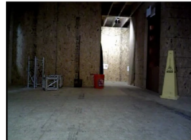
Figure 1: Example image used with the given prompt to GPT-4.

You are a robot operating in an urban search and rescue scenario. The following image shows your current field of view.